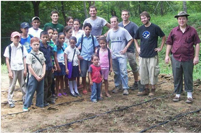
Six members of the EOS team stand proudly with the students of a school in Palmar Sur, Nicaragua after working together to install a drip irrigation system on their school grounds. This system will be used to teach students about agriculture and the importance of water conservation while introducing this technology to an entire village.

We started 2009 with hopes of making a difference in Nicaragua. After having a year to understand our role and to develop projects, we are taking momentum into 2010 and have set specific goals around our three projects: drip irrigation systems, fuel-efficient ovens, and biodigesters. We is leading our efforts on the ground and has engaged and energized Peace Corps Volunteers (PCVs) in multiple locations throughout the country to install these technologies, creating opportunities for more Nicaraguans and increasing the impact of EOS.