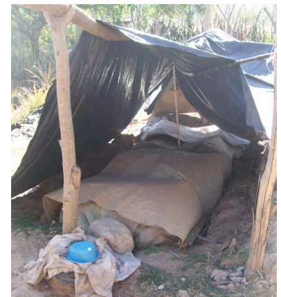
This biodigester, installed by EOS, removes a family's dependence on cooking with solid fuels. They convert manure to biogas and produce up to five hours of gas for cooking per day. Each system costs $130.]