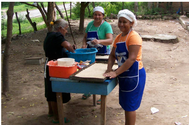
Members of a women's co-op in San Jose, Nicaragua prepare cookies to be baked in their fuel-efficient oven that EOS built. They meet twice a week to bake, giving them a social outlet and a source of income, as their products have been successful selling at market.

Visit www.eosintl.org/projects to learn more about our work in Nicaragua.